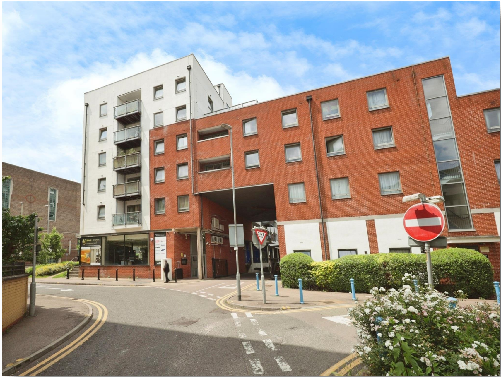
Ashleigh Court, Loates Lane, Watford, WD17 2PJ