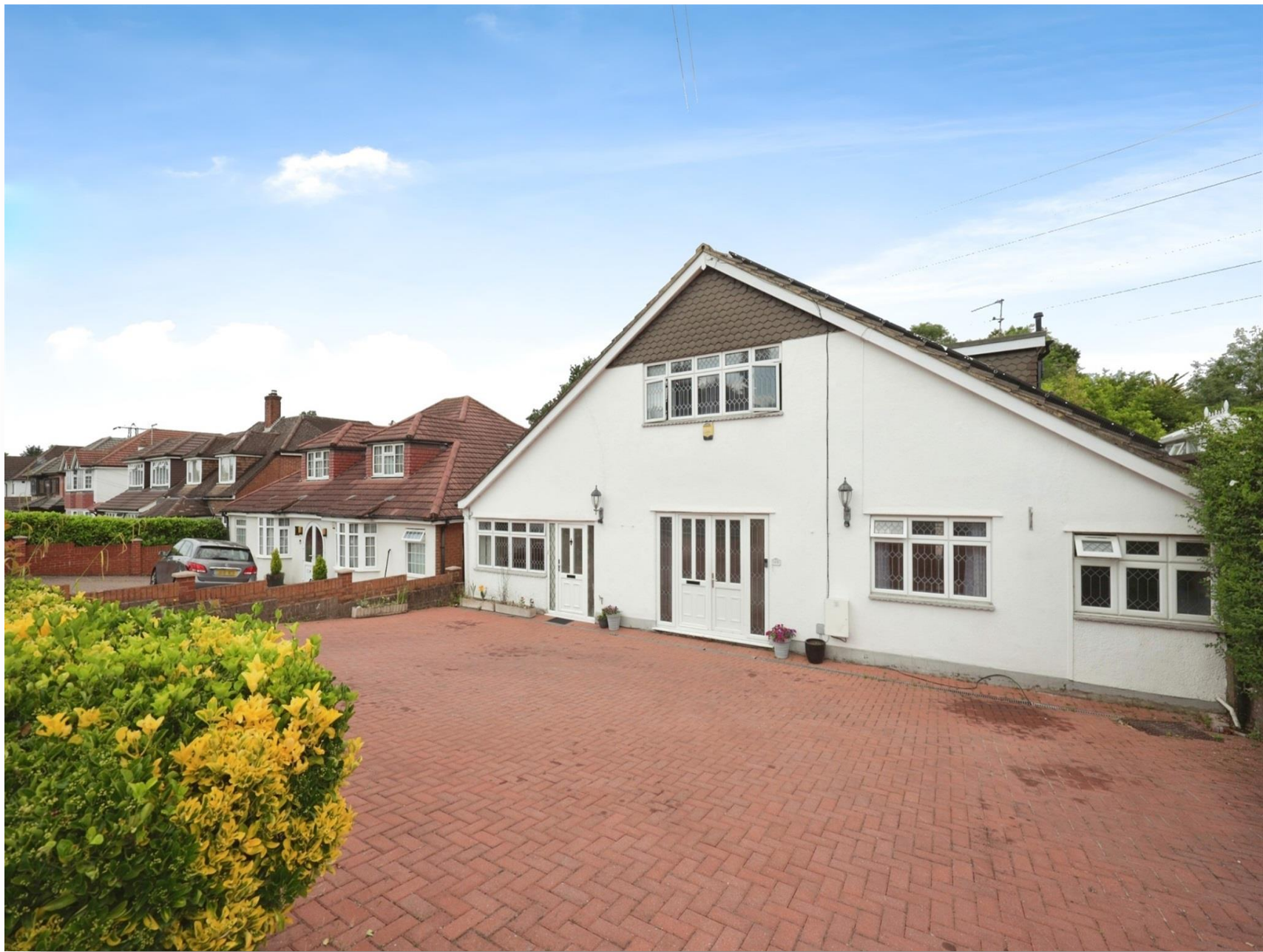
Brookdene Avenue, Watford, WD19 4LG