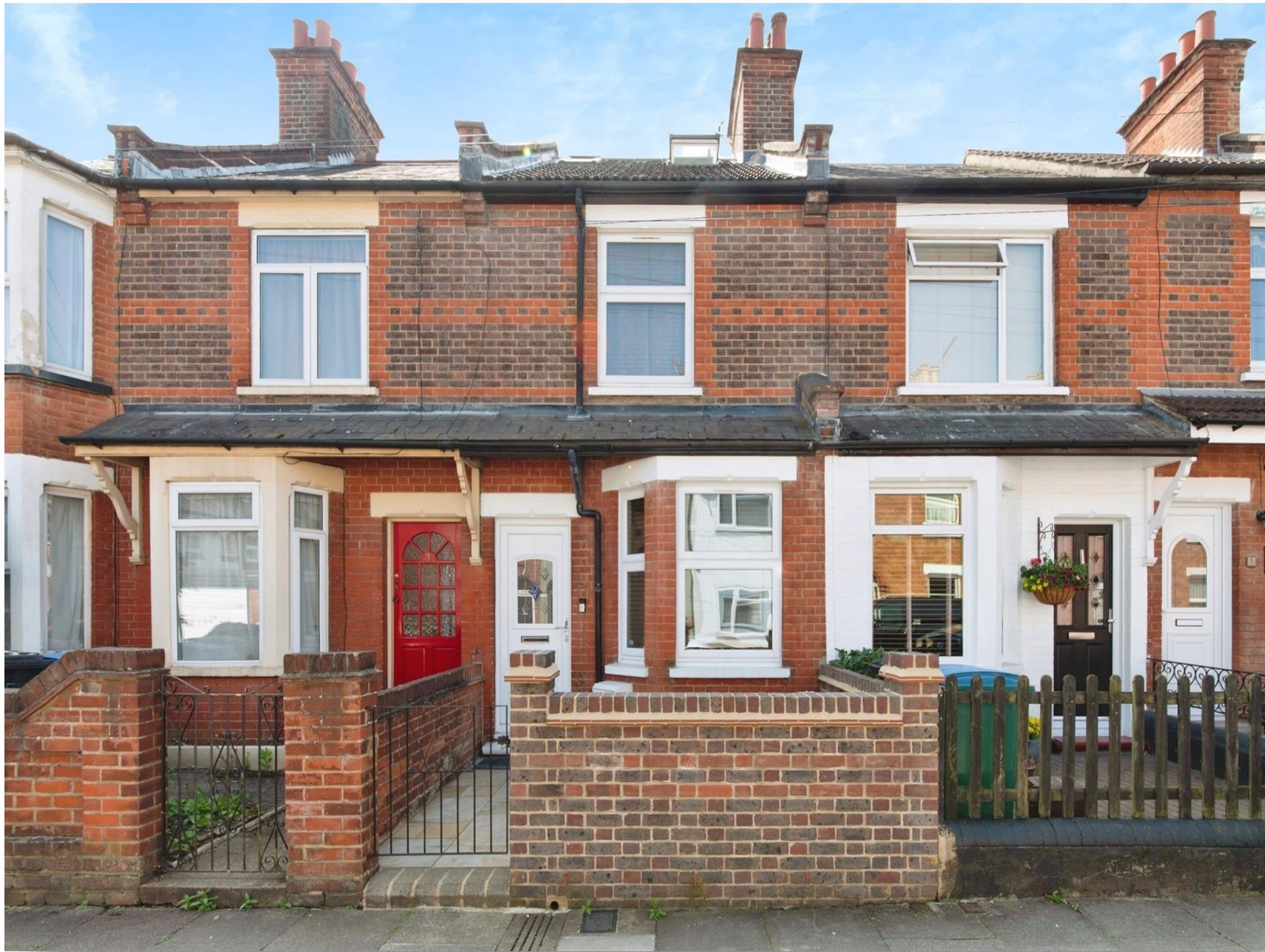
Stanmore Road, Watford WD24 5ET