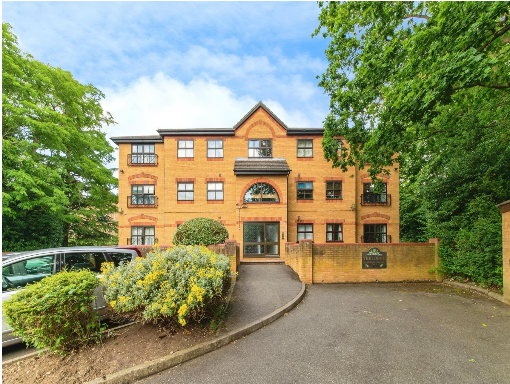
The Lodge, Orphanage Road, Watford, WD24 4QZ