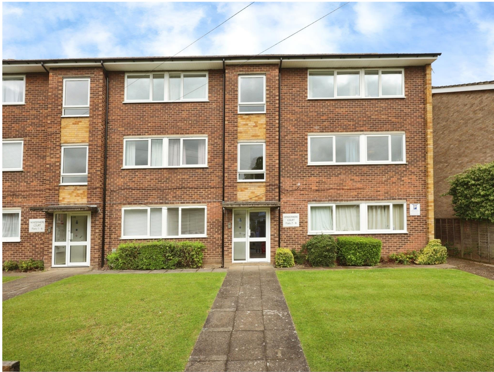
Windermere Court, Alexandra Road, Watford, WD17 4UA