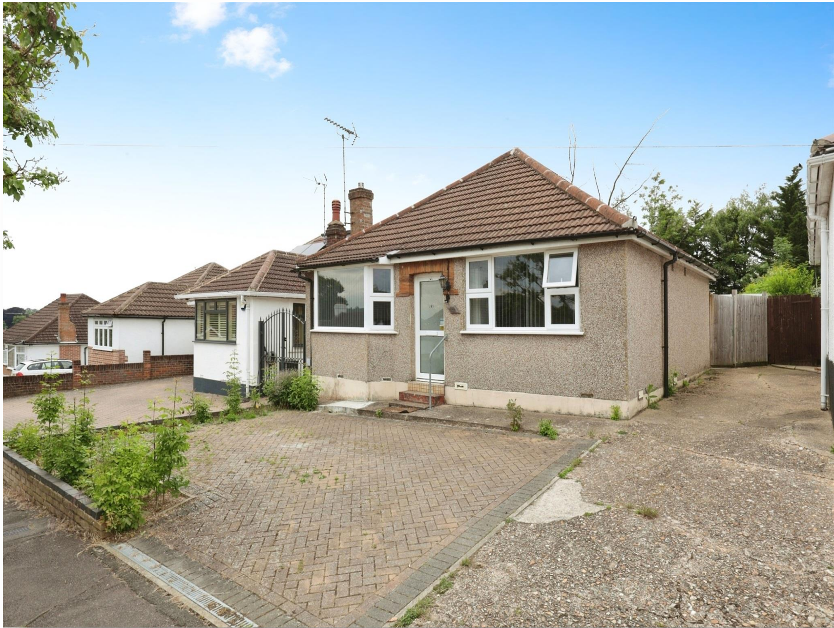
Penrose Avenue, Watford, WD19 5AA