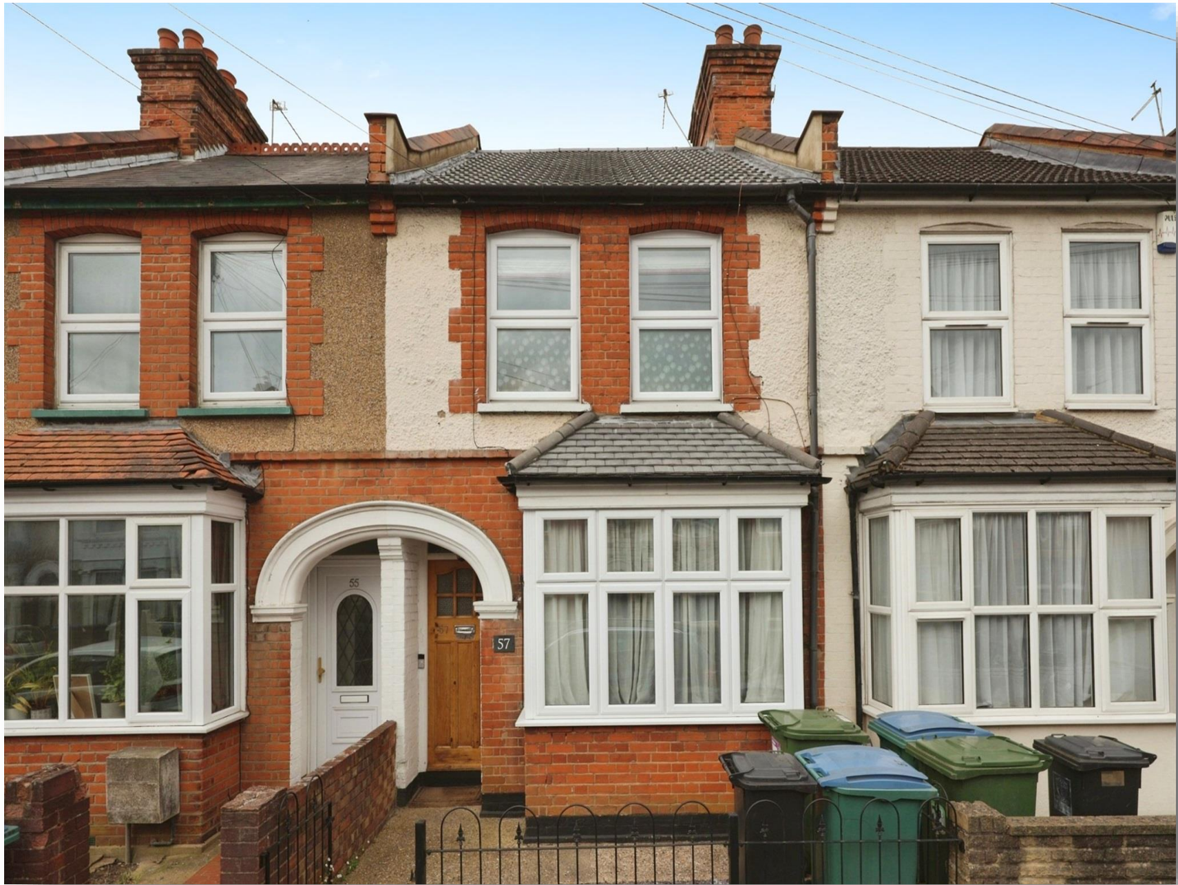
Kensington Avenue, Watford WD18 7RZ