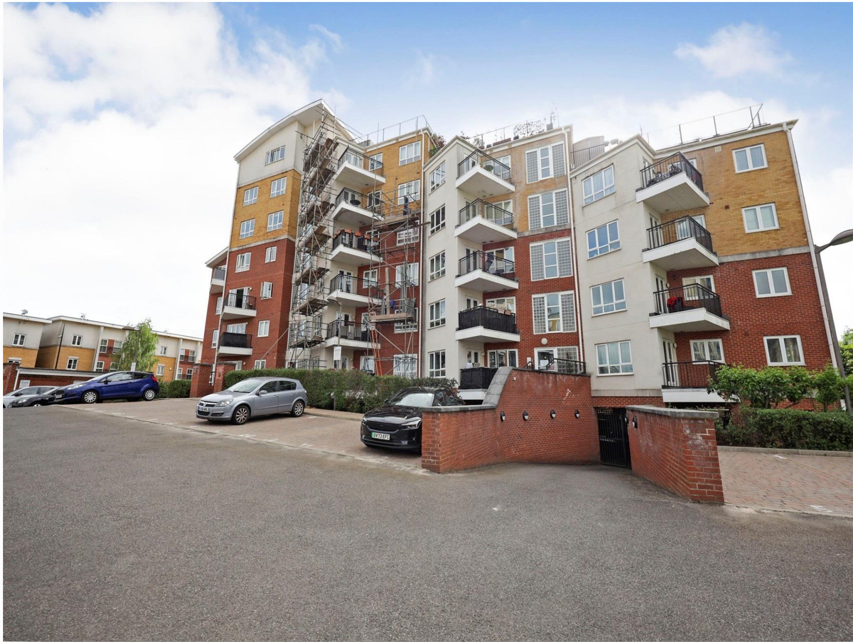
Rockwell Court, The Gateway, Watford WD18 7HQ