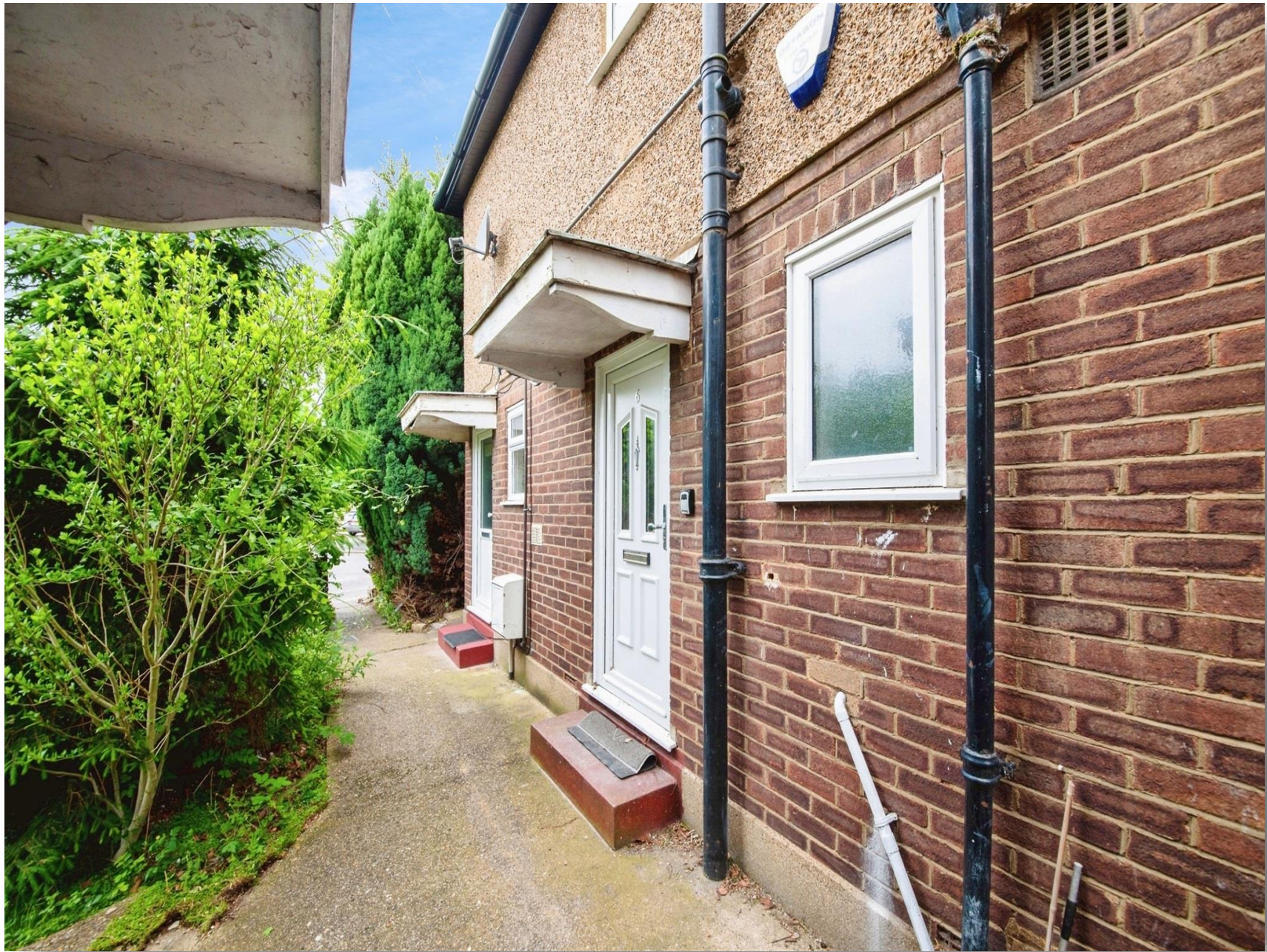
Church Road, Watford WD17 4PU