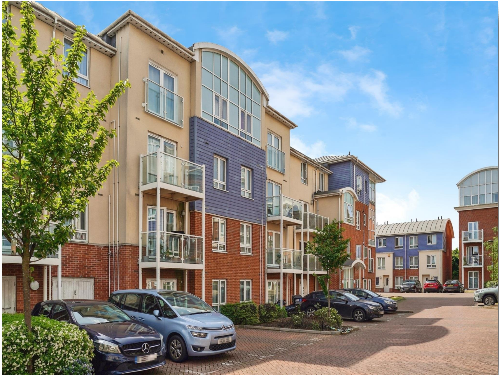
Wells Court Pumphouse Crescent, Watford WD17 2AA