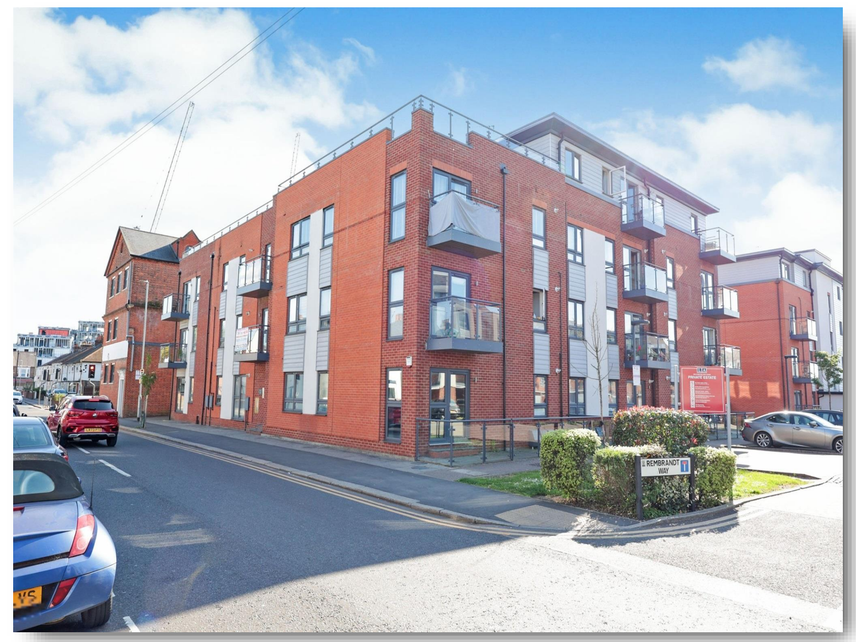
Lucas Court, Hagden Lane, Watford WD18 7DH