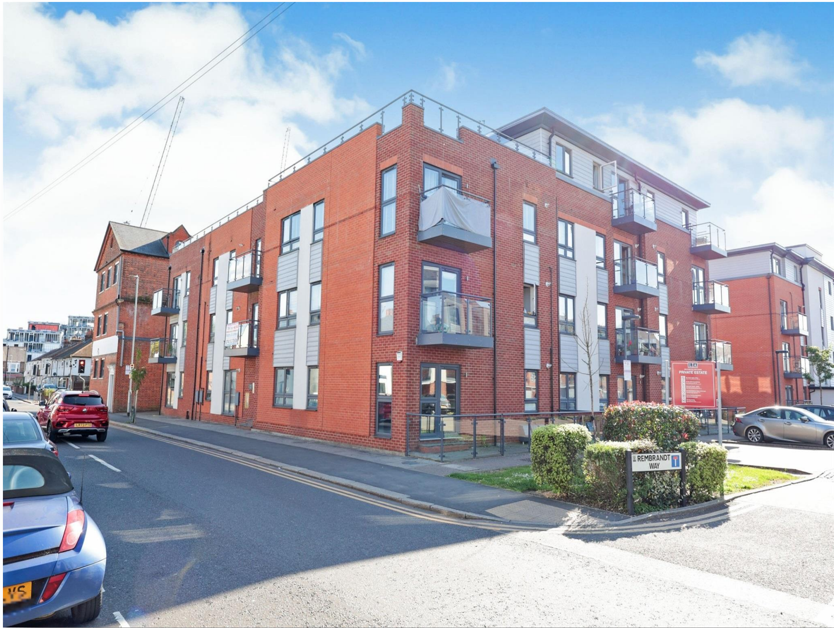
Lucas Court Hagden Lane, Watford WD18 7DH