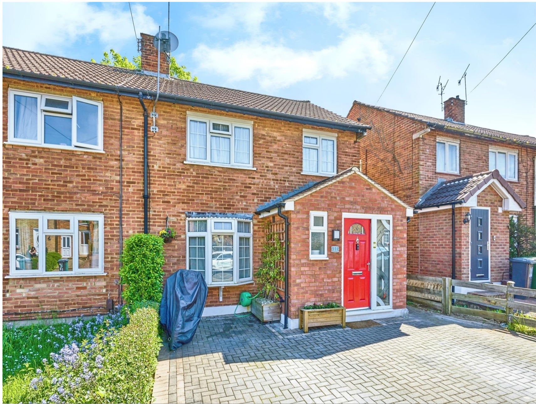
Queenswood Crescent, Watford, WD25 7DG