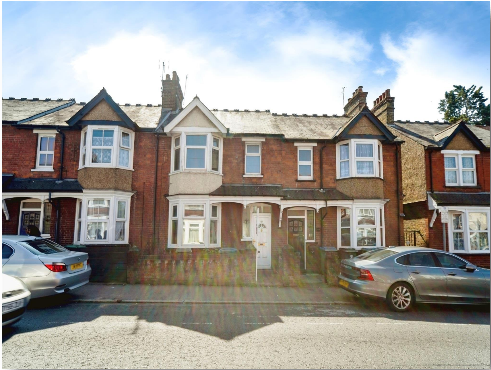
Vicarage Road, Watford WD18 0HD