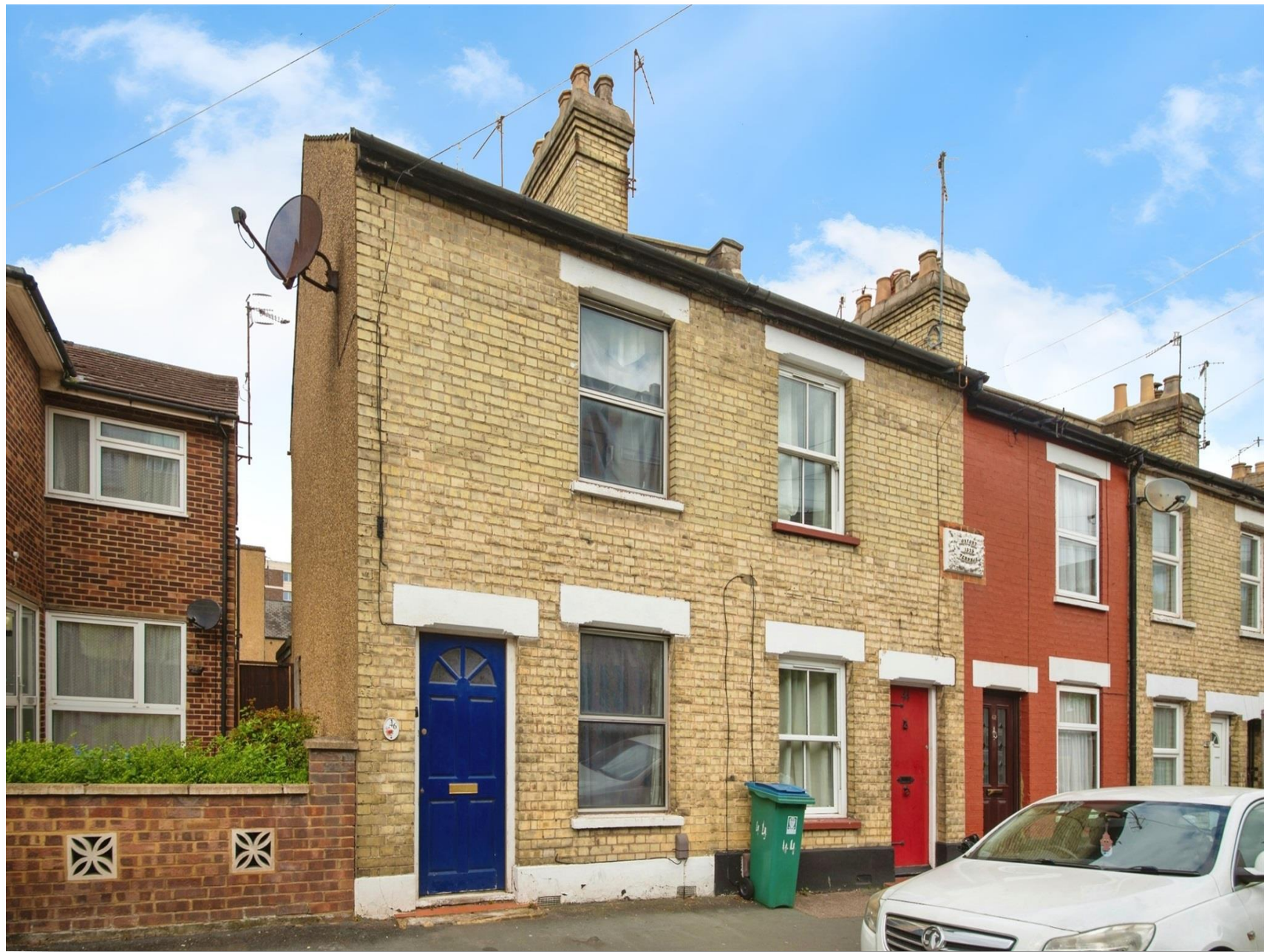
Westland Road, Watford, WD17 1QX