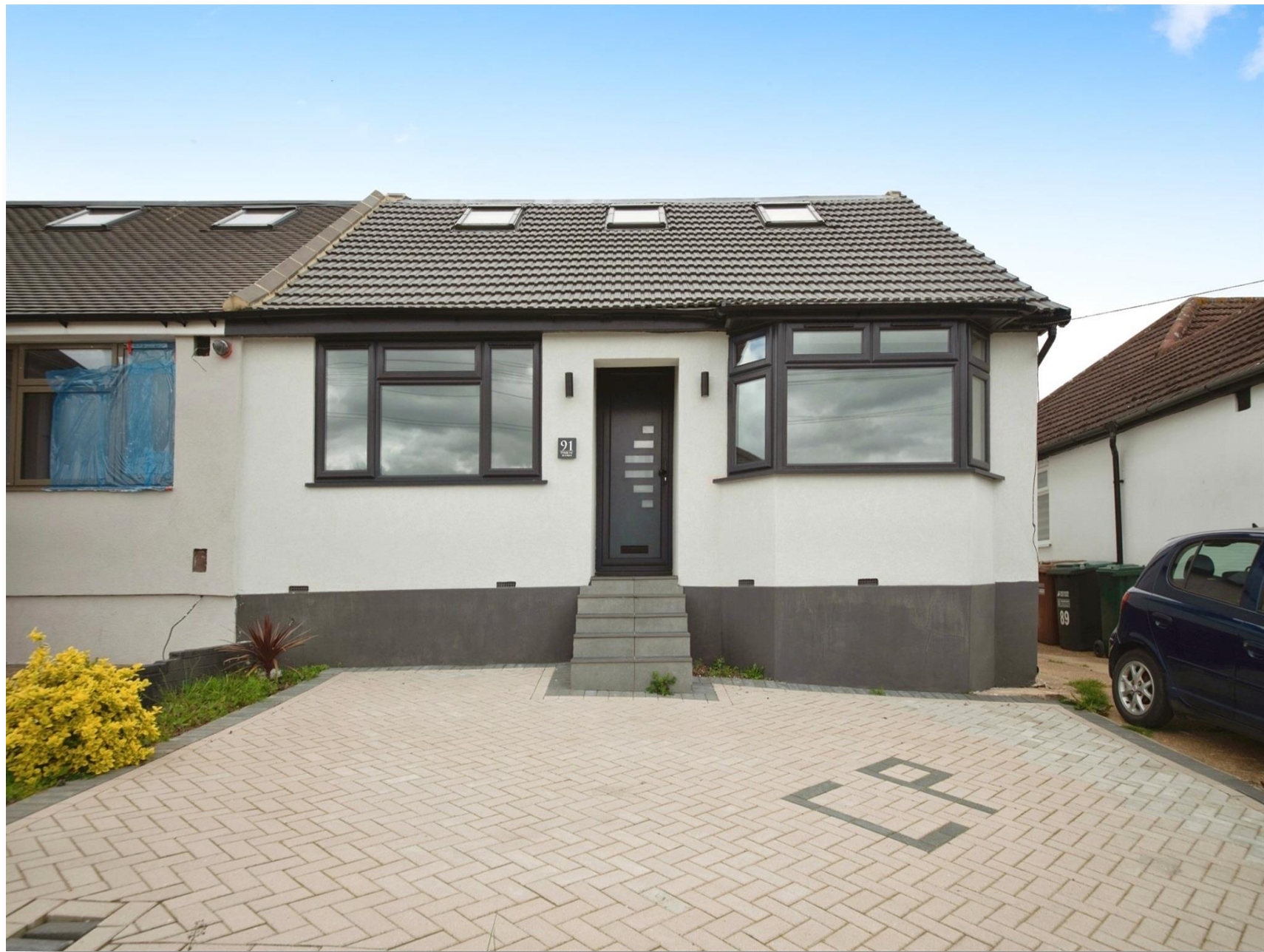
Penrose Avenue, Watford WD19 5AA