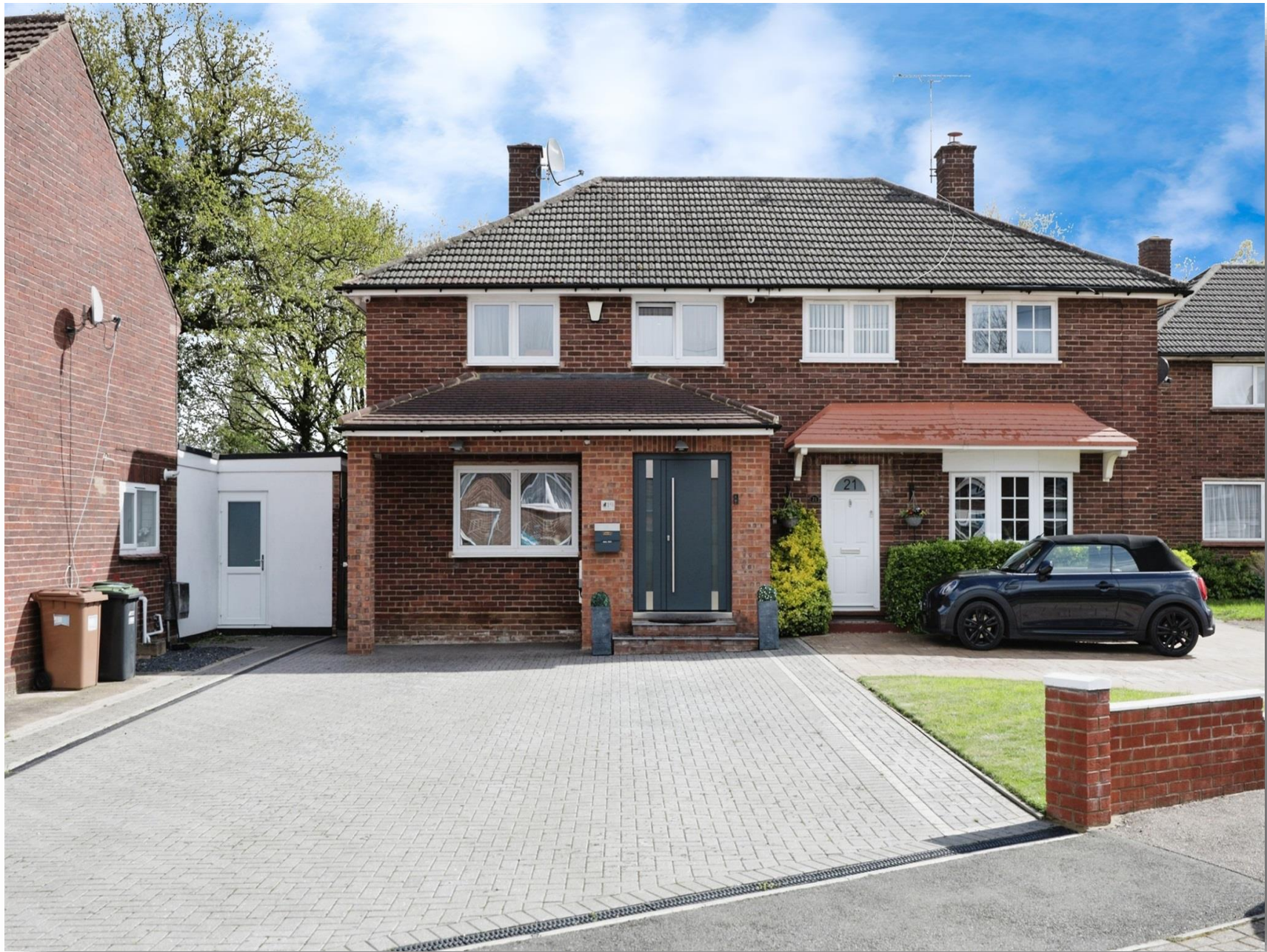
Oulton Way, Watford WD19 5EJ