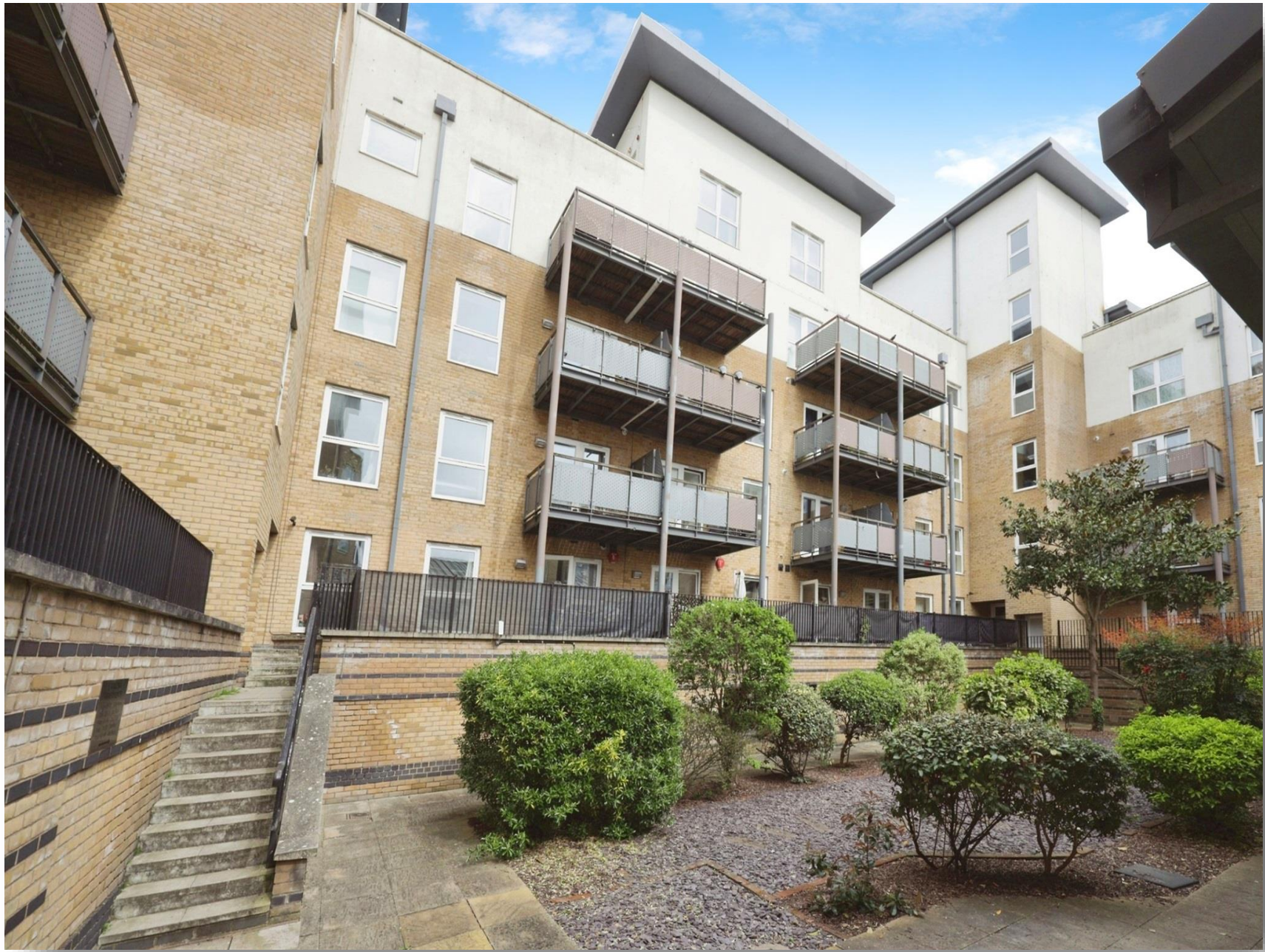
Catalonia Apartments Metropolitan Station Approach, Watford WD18 7BL