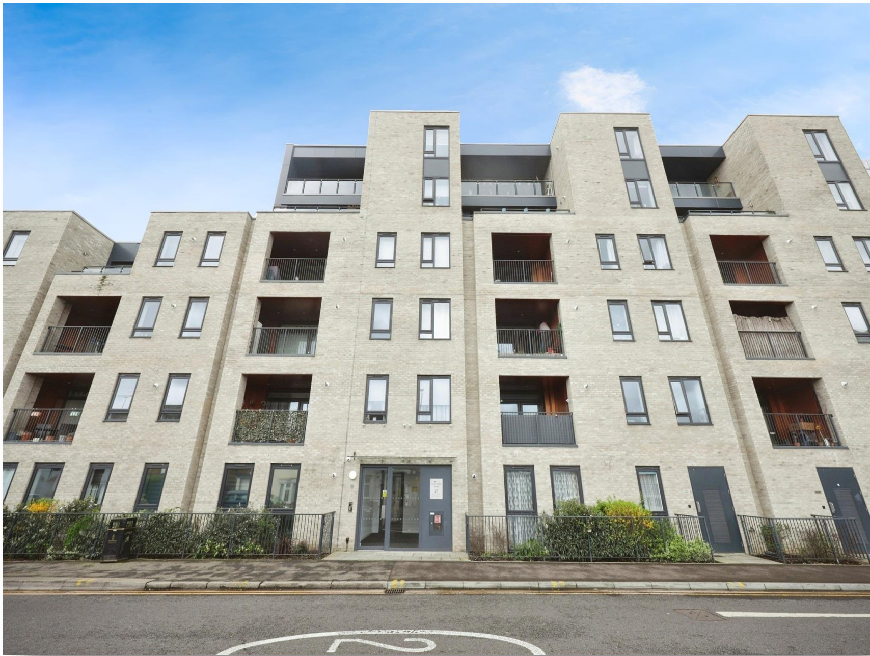
Nash Trade House, Woodford Road, Watford, WD17 1PB