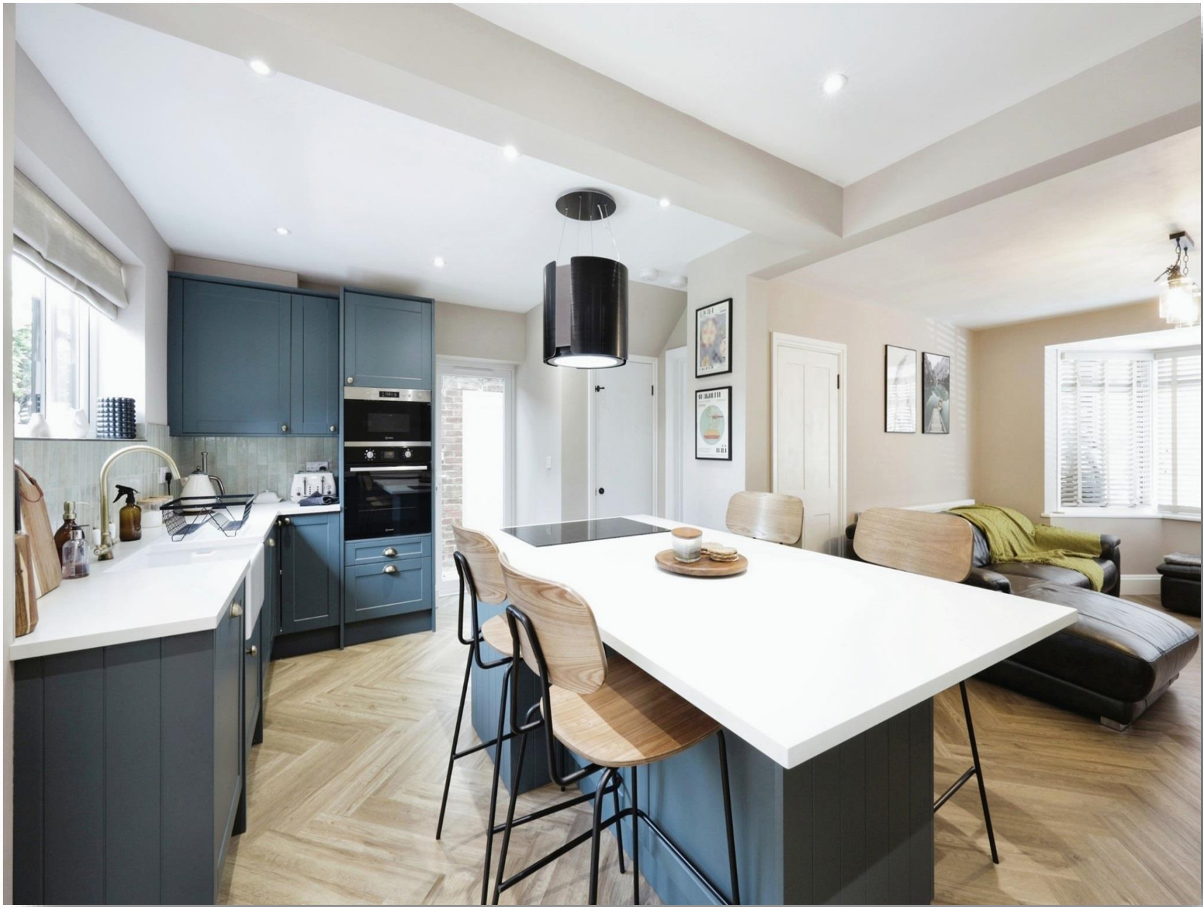
Woodgate, Watford WD25 7DF