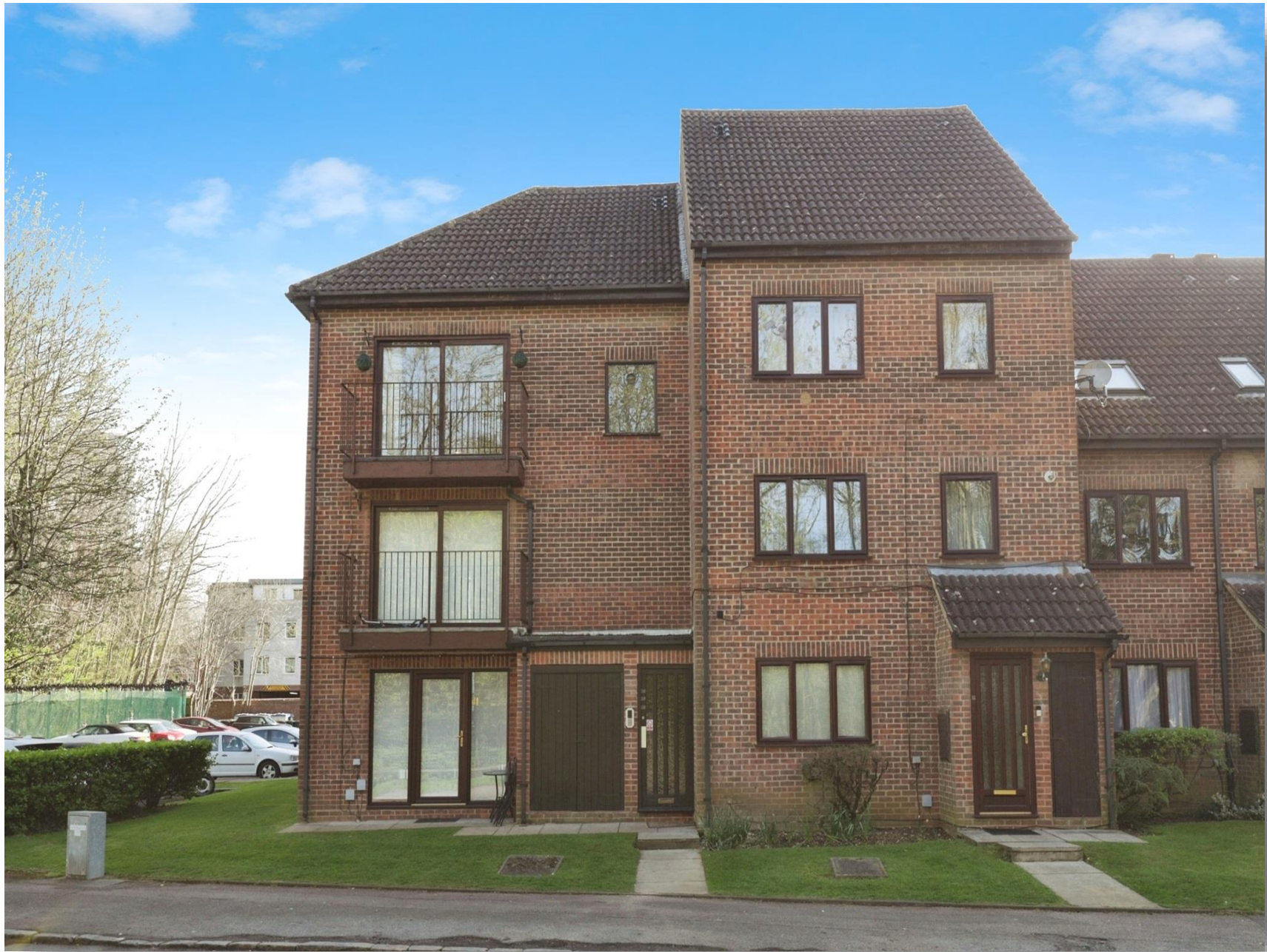
Sheraton Mews, Watford WD18 7PE