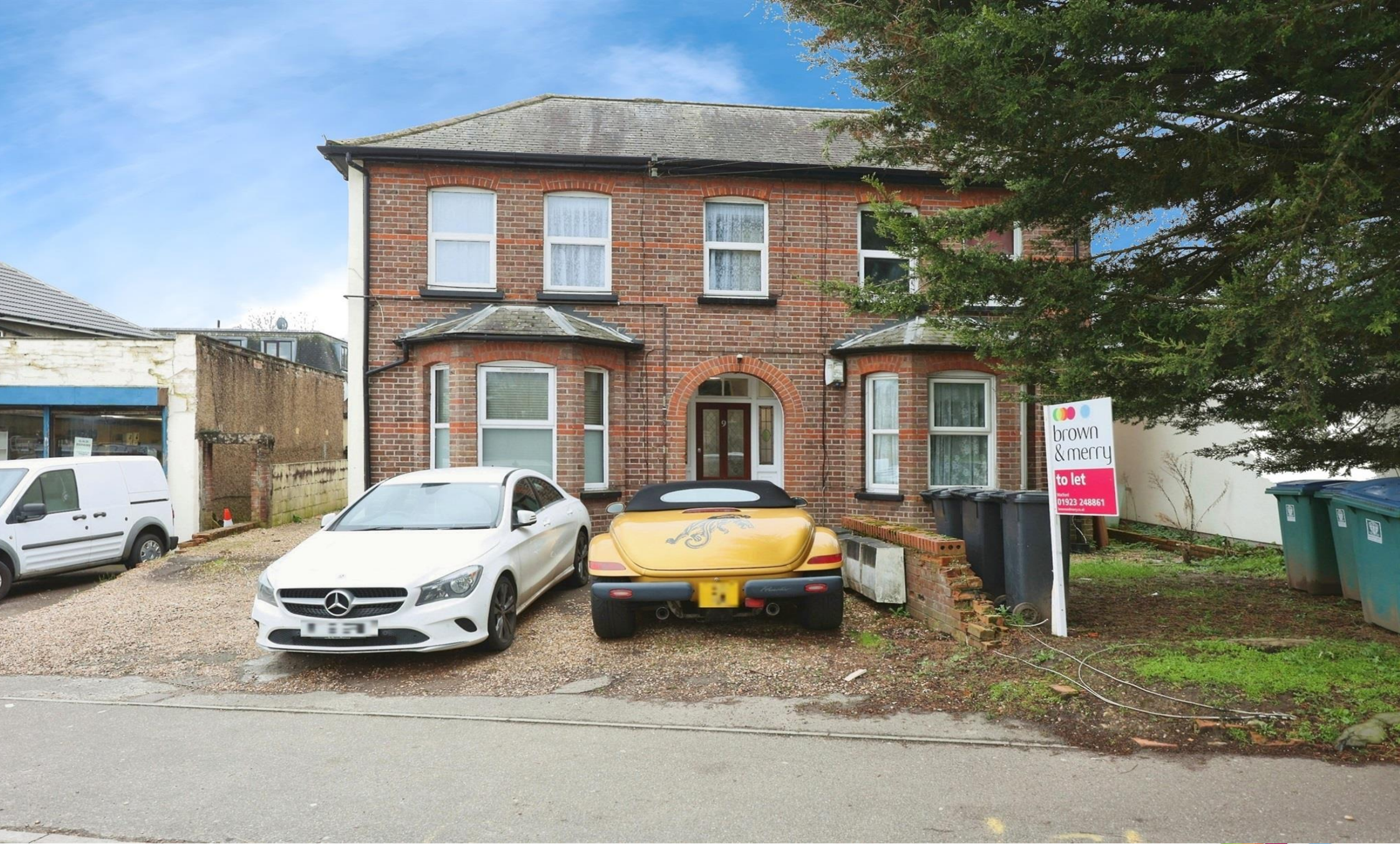
Horseshoe Lane, Watford, WD25 0LN