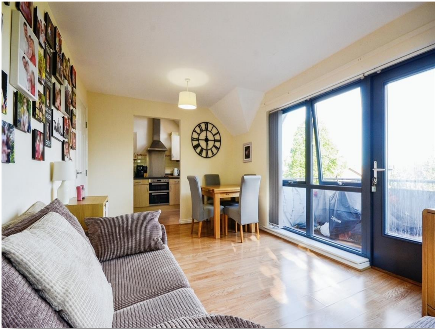
Matis House Queensway, Hemel Hempstead HP2 5WU