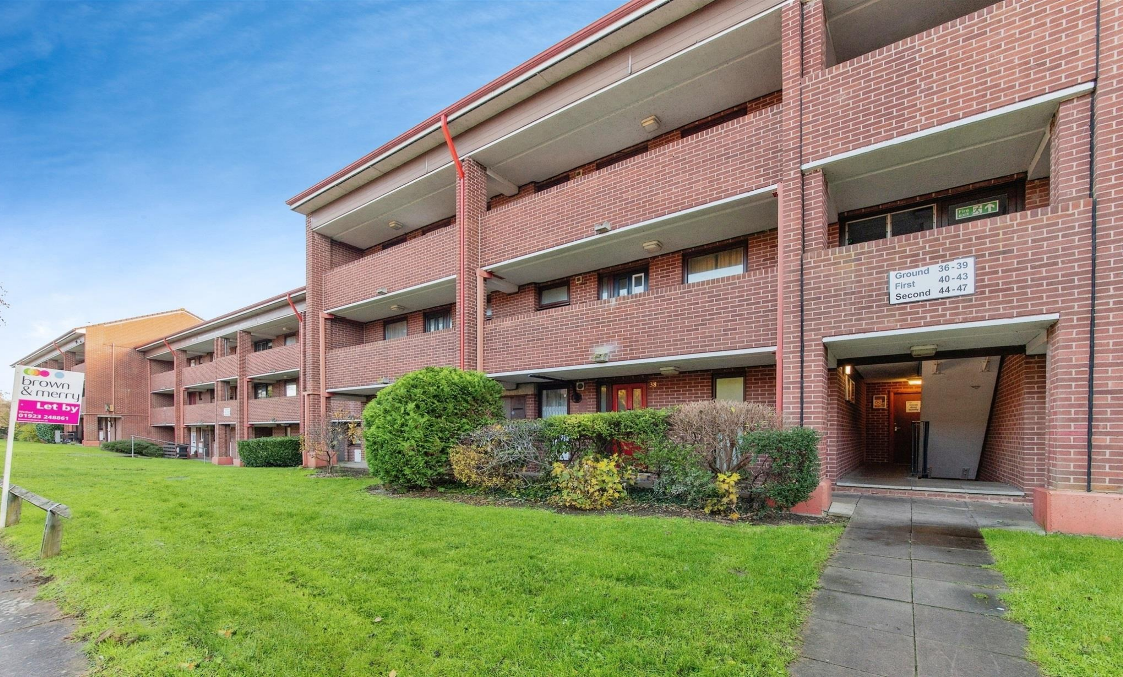
Caractacus Cottage View, Watford, WD18 6JW