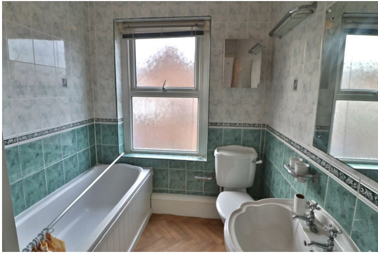
Incorporating a three piece suite comprising of a low level w.c, pedestal hand wash basin, and a bath with shower over. Complete with a Upvc double glazed window to the rear elevation, tiled walls and wooden flooring.