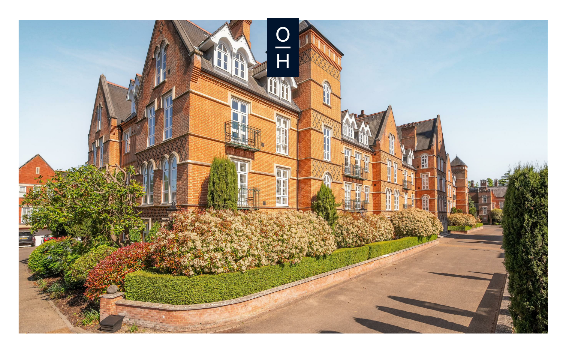
The Grange, Virginia Water