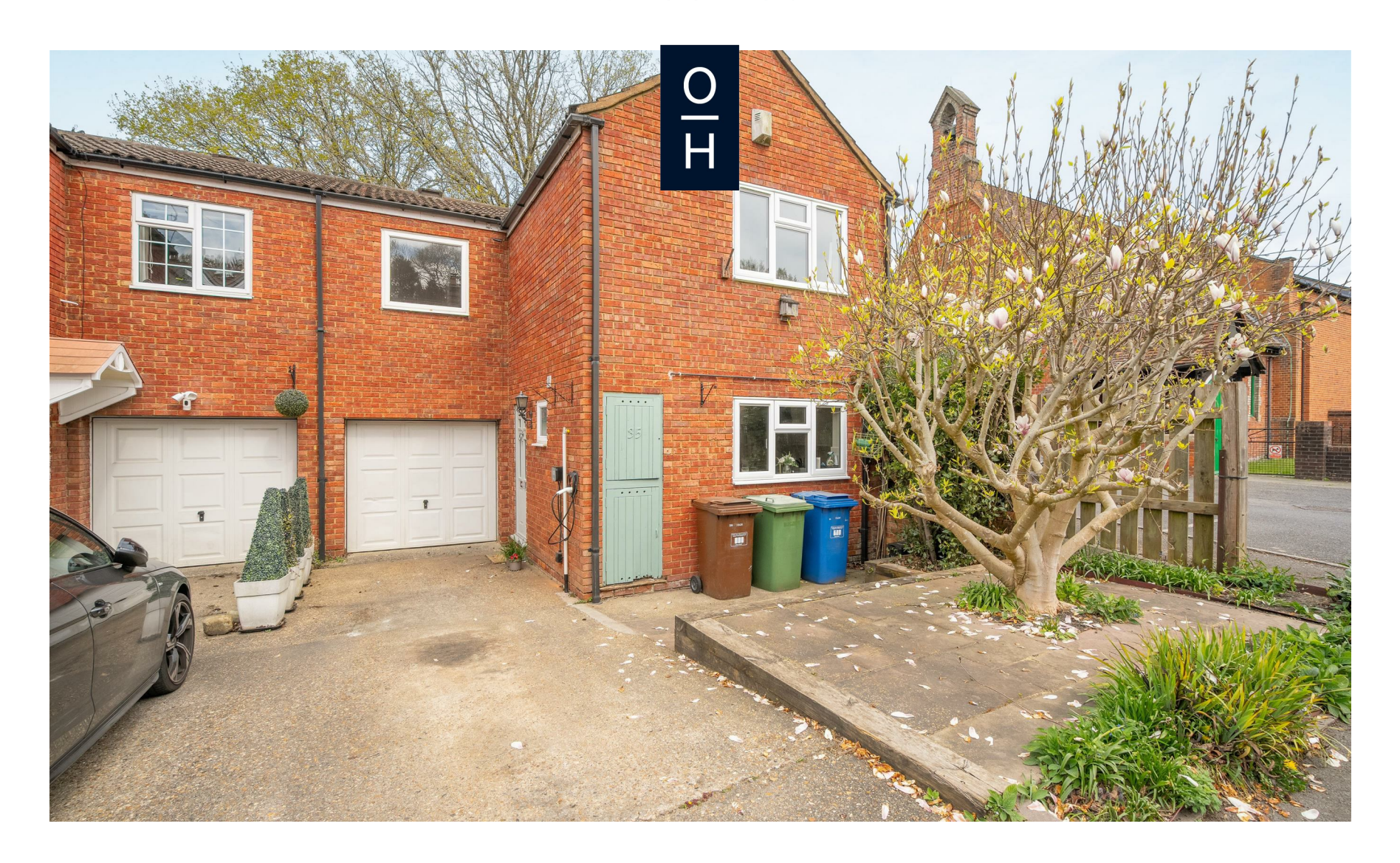
Church Road, Ascot