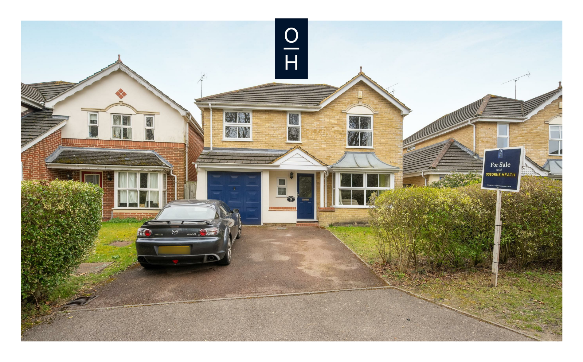
Langdale Drive, Ascot