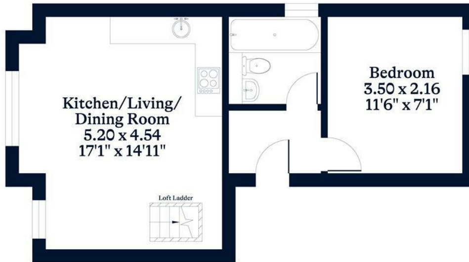
Apartment First Floor

This plan is for illustration purposes only