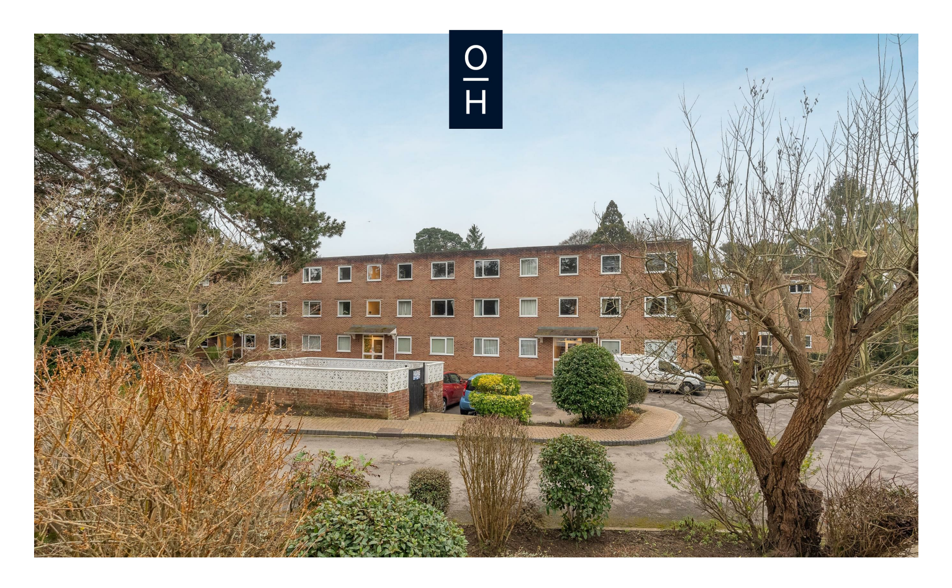
St Andrews Court, Sunninghill