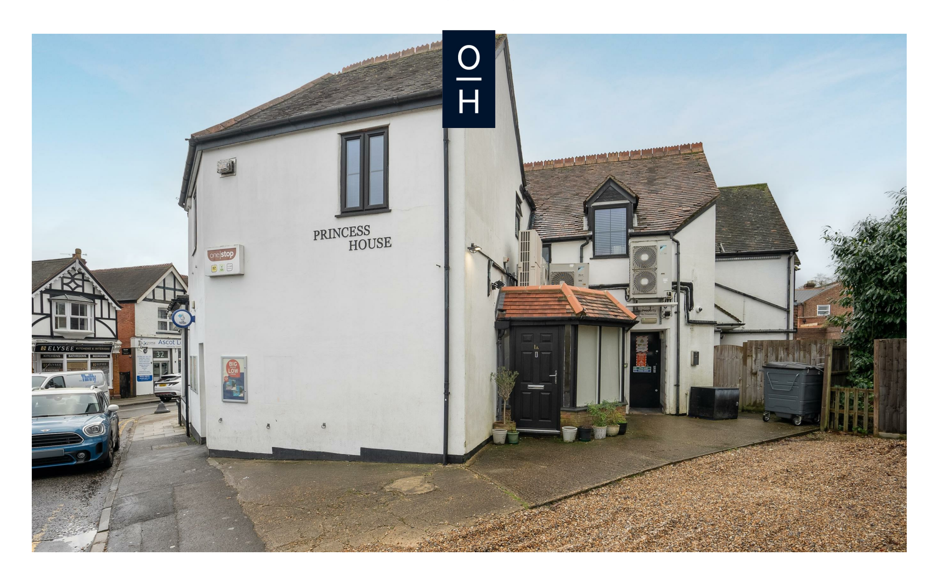
High Street, Sunninghill