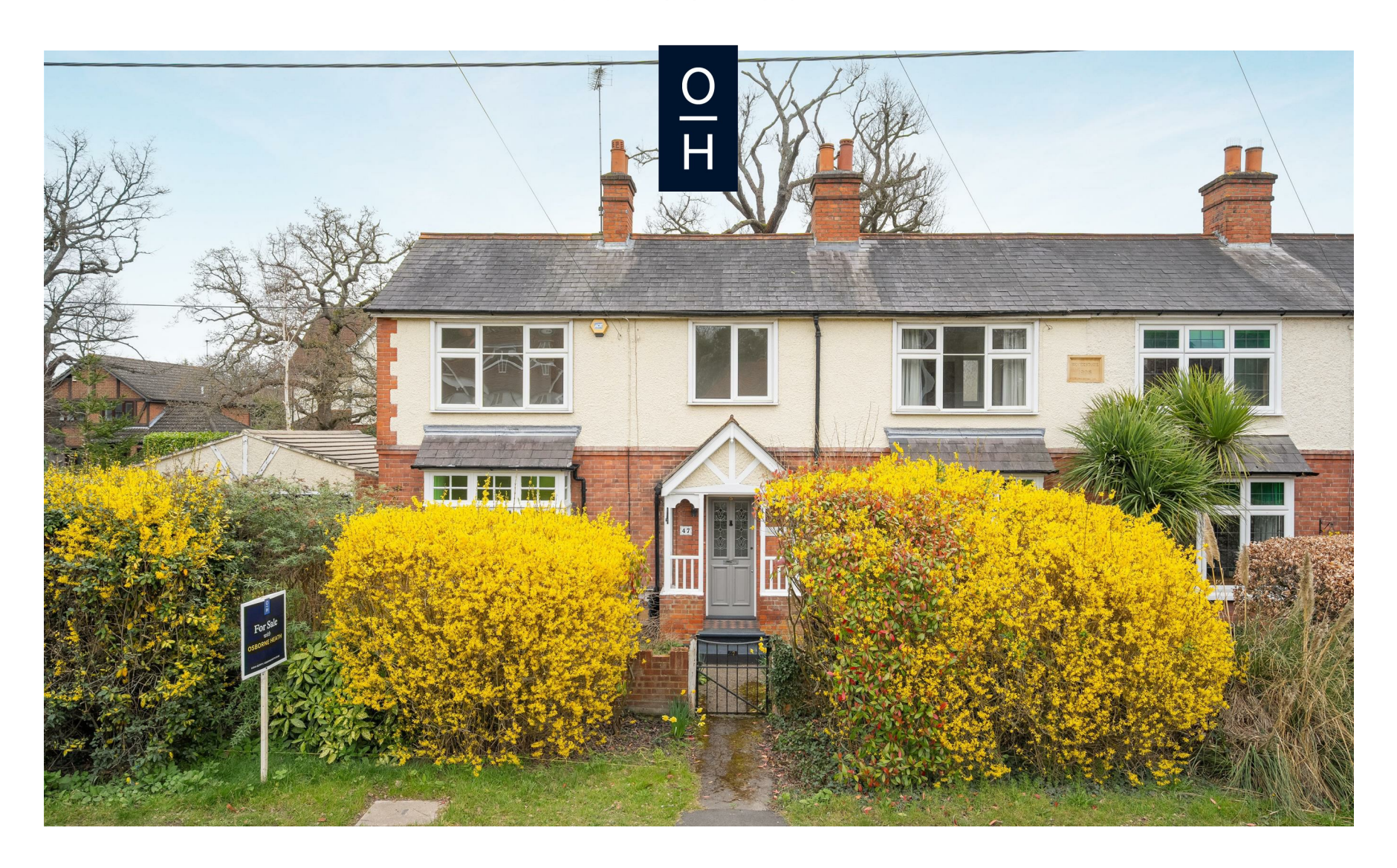
New Road, Ascot