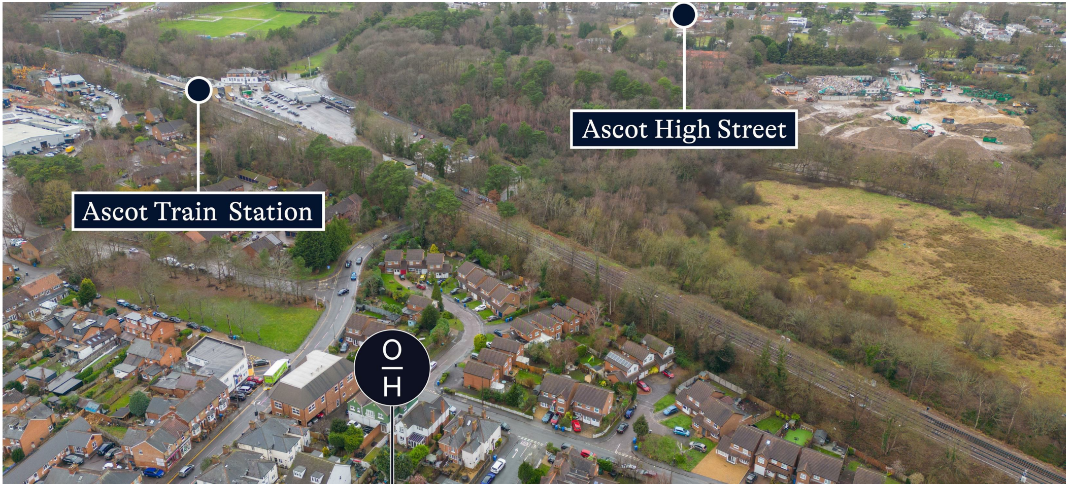
Ascot Train Station