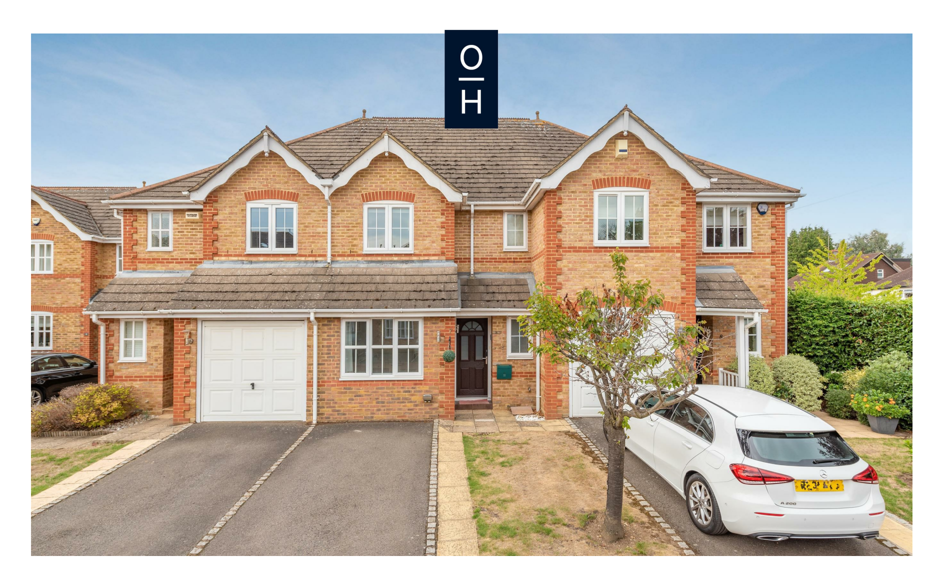
Guards Court, Sunningdale