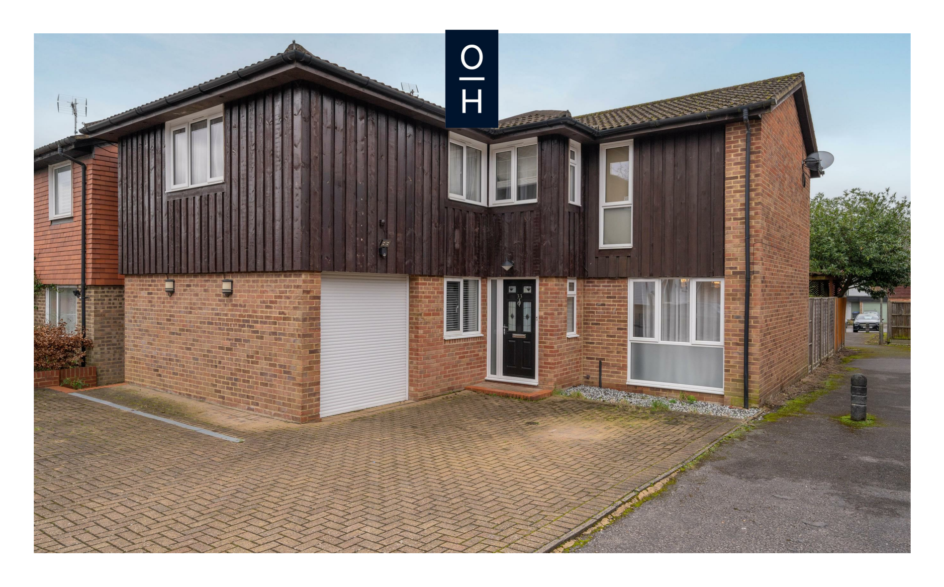
Cavendish Meads, Sunninghill