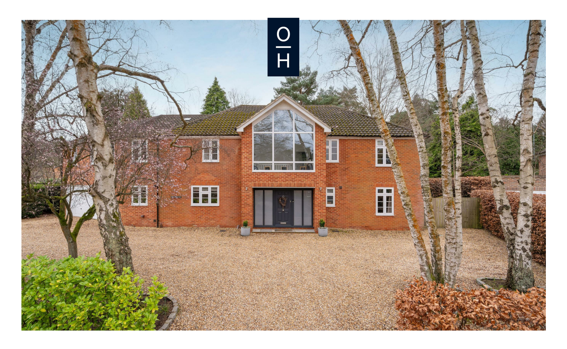
Llanvair Close, Ascot