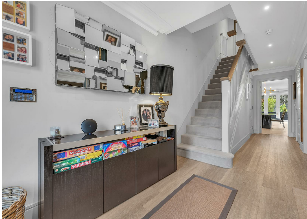
A four bedroom, three bathroom family home built by Millgate Homes and designed by Alexander James Interiors with driveway parking and garage.