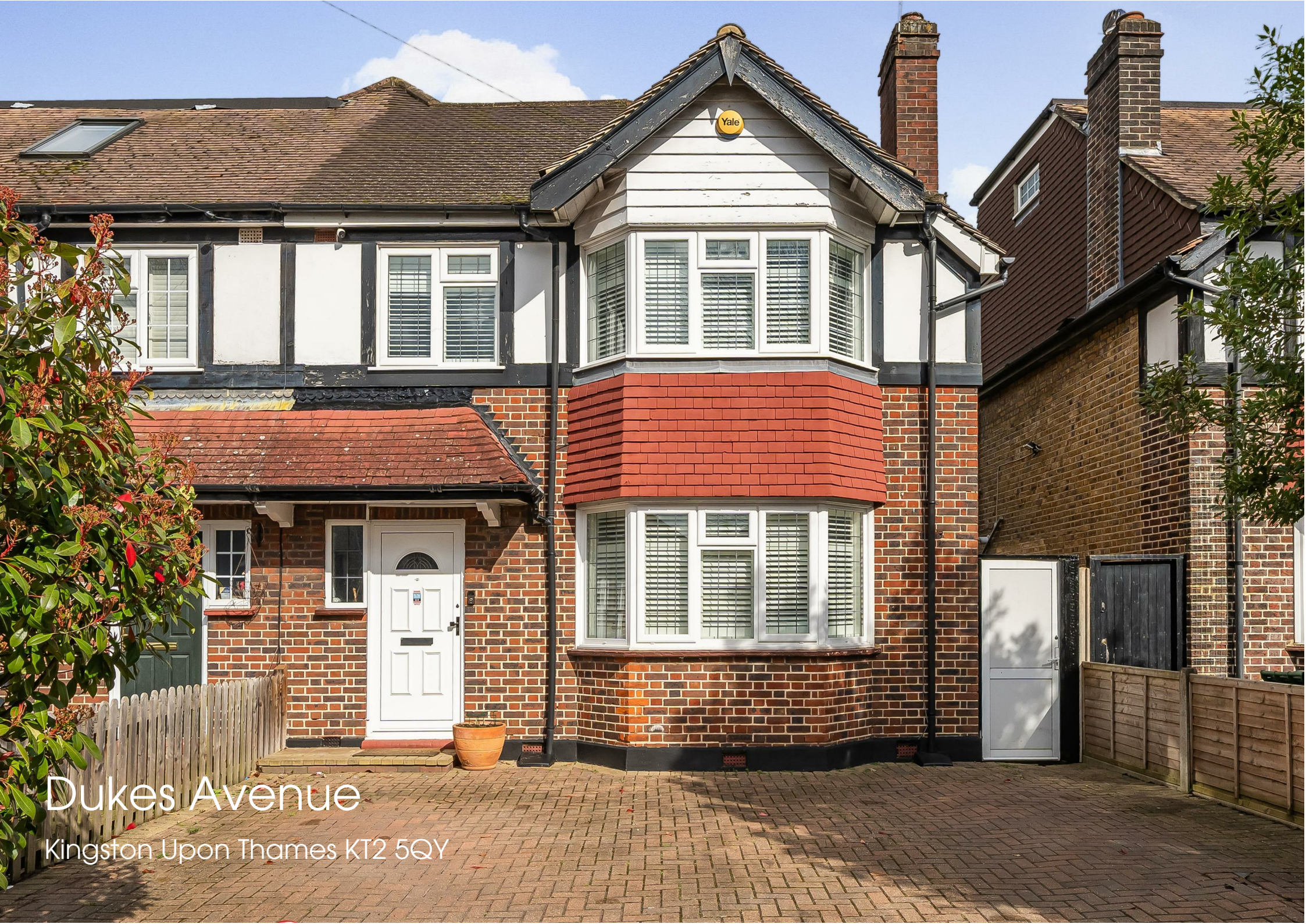
Dukes Avenue Kingston Upon Thames KT2 5QY