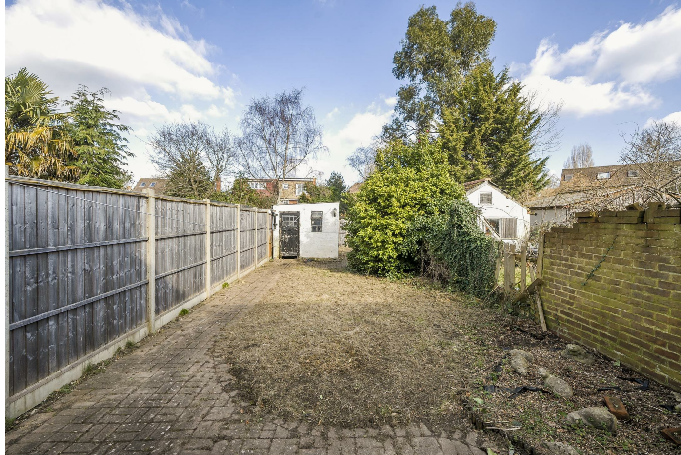
Guide Price £750,000