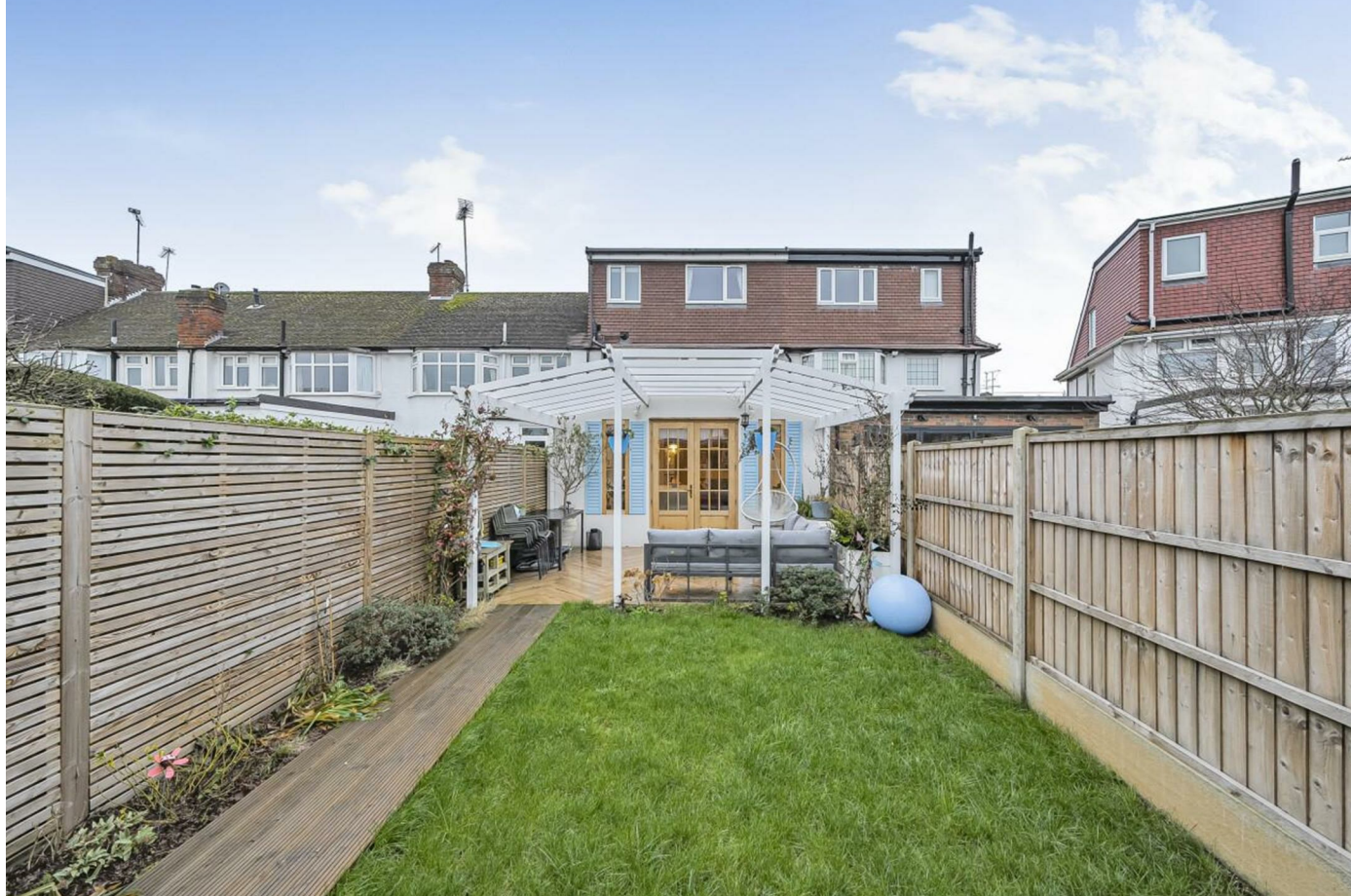
Guide Price £1,100,000