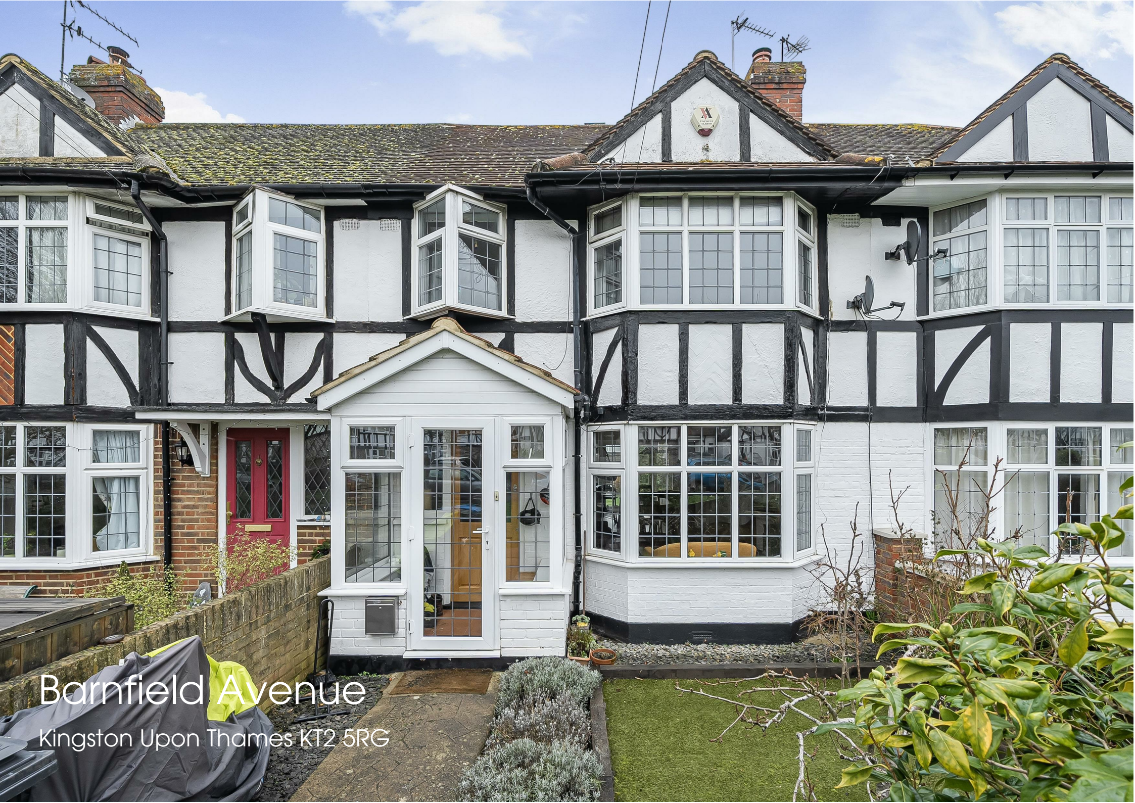
Barnfield Avenue Kingston Upon Thames KT2 5RG