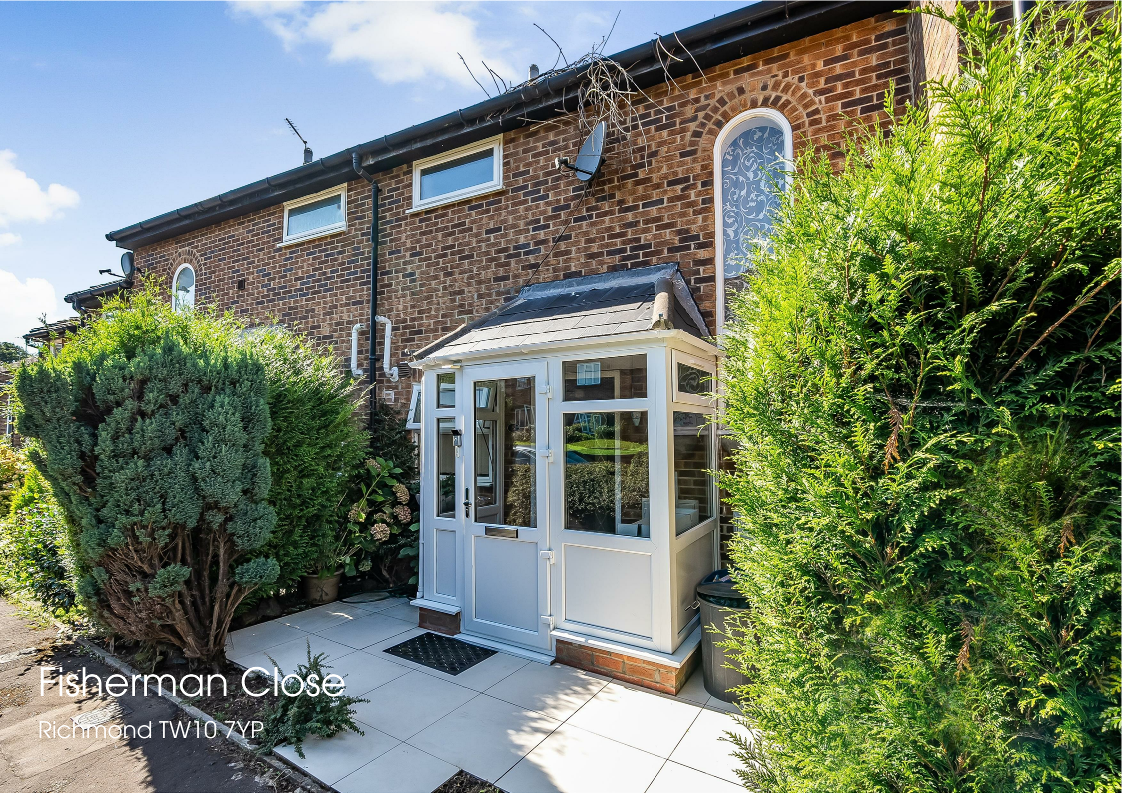
Fisherman Close Richmond TW10 7YP