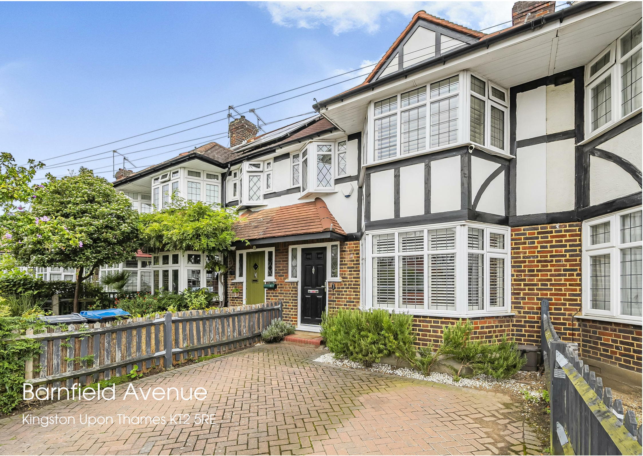
Barnfield Avenue Kingston Upon Thames KT2 5RE