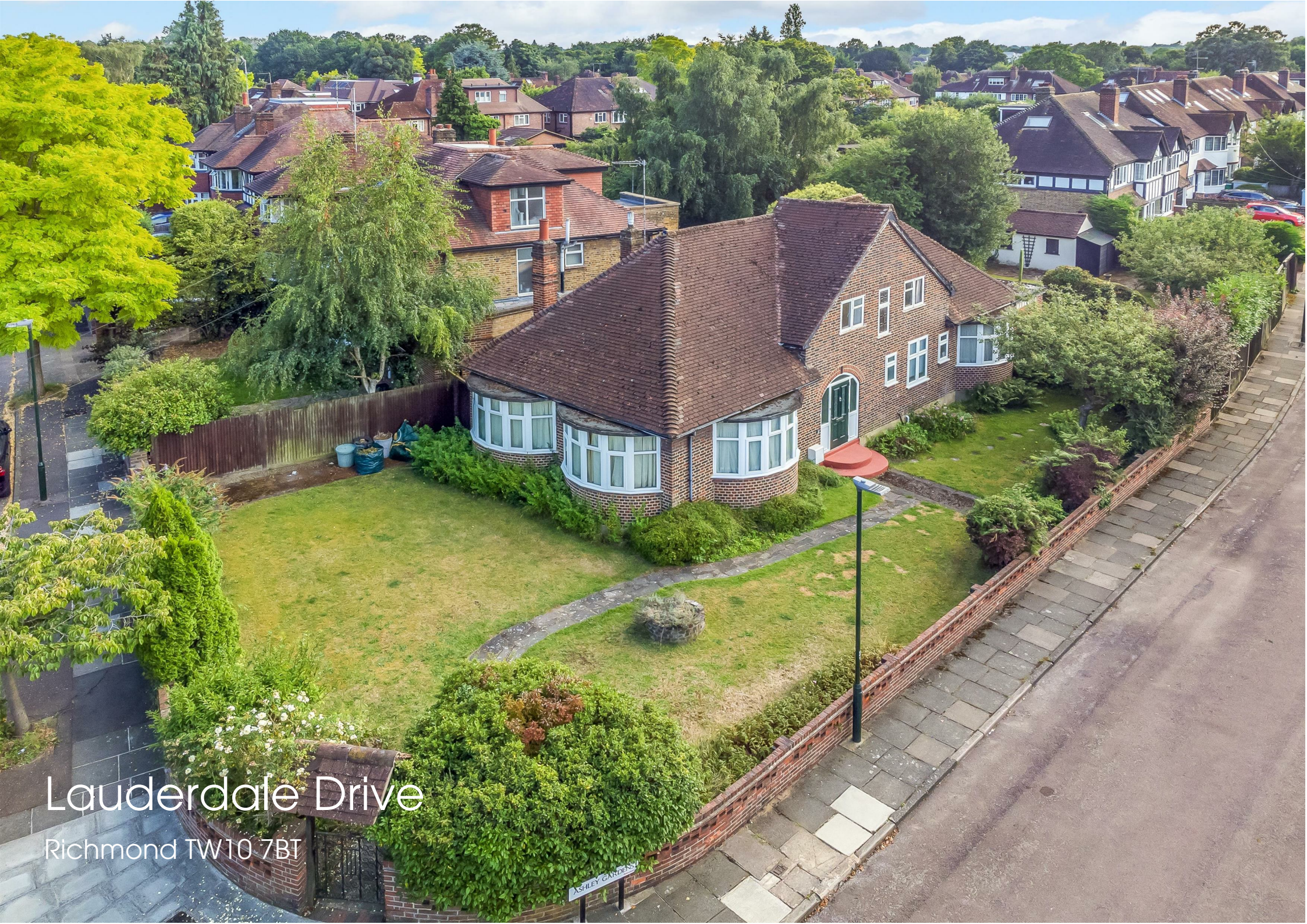
Lauderdale Drive Richmond TW10 7BT