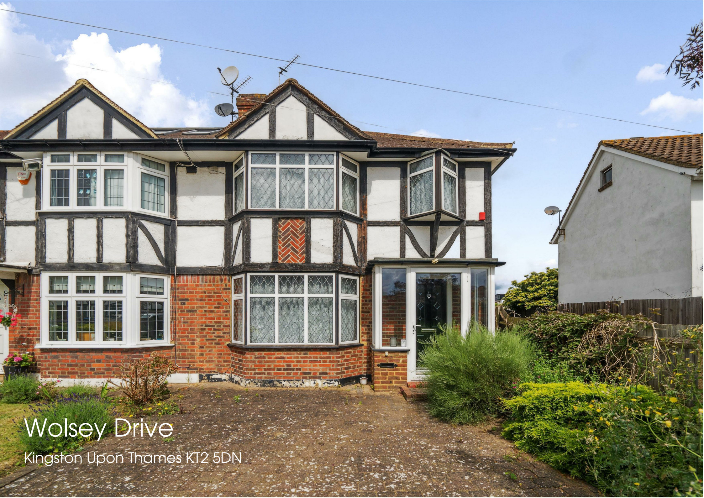
Wolsey Drive Kingston Upon Thames KT2 5DN