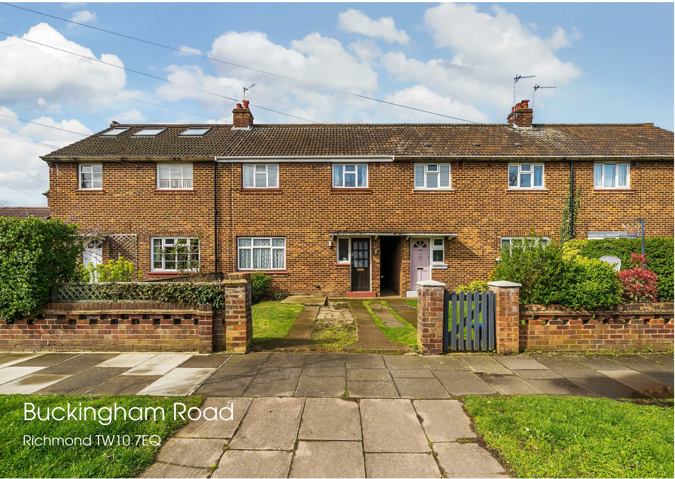
Buckingham Road Richmond TW10 7EQ