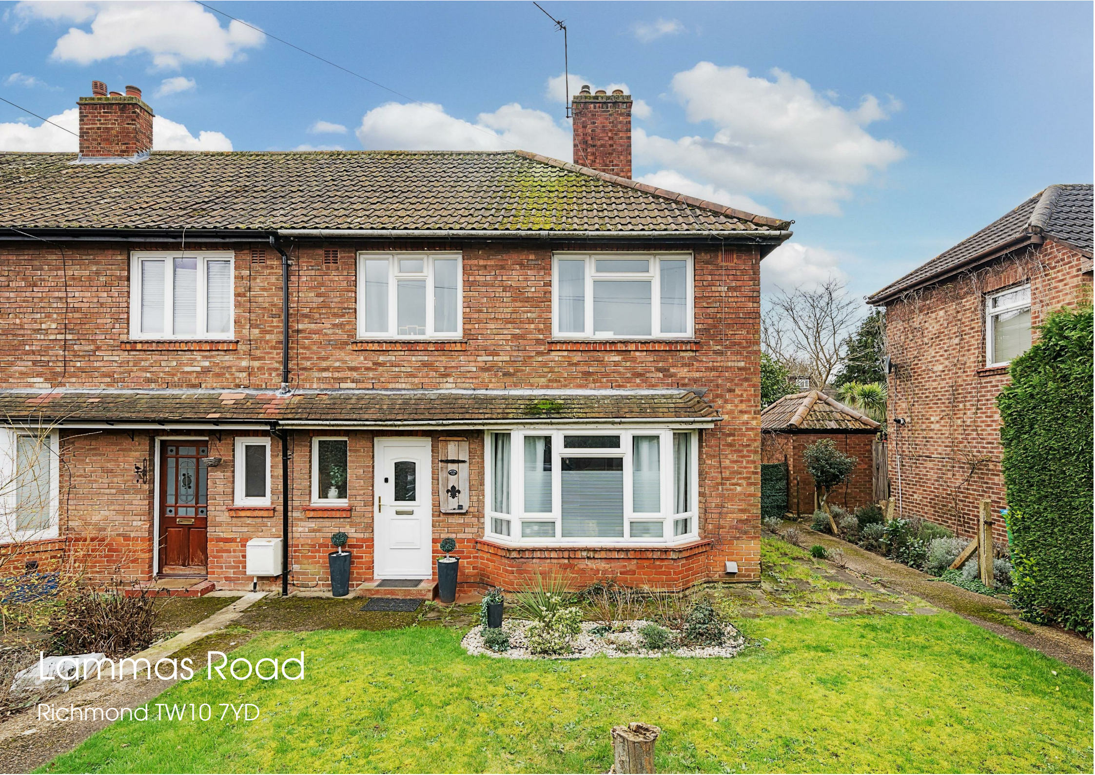
Lammes Road Richmond TW10 7YD