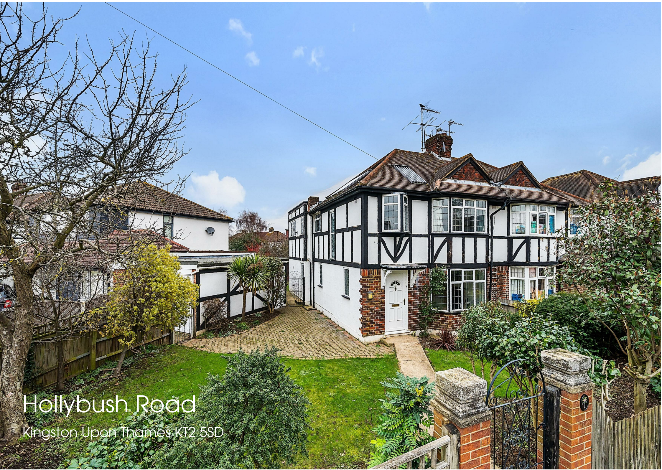
Hollybush Road Kingston Upon Thames KT2 5SD

323 Richmond Road Ham Surrey KT2 5QU www.gibsonlane.co.uk Tel: 020 8247 9444