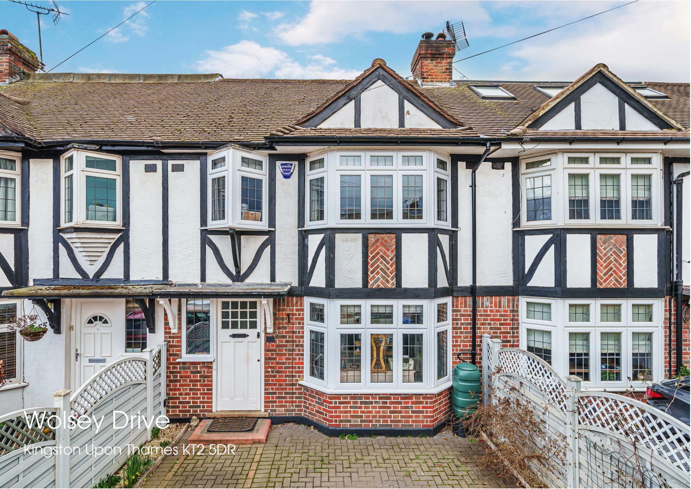
Wolsey Drive Kingston Upon Thames KT2 5DR