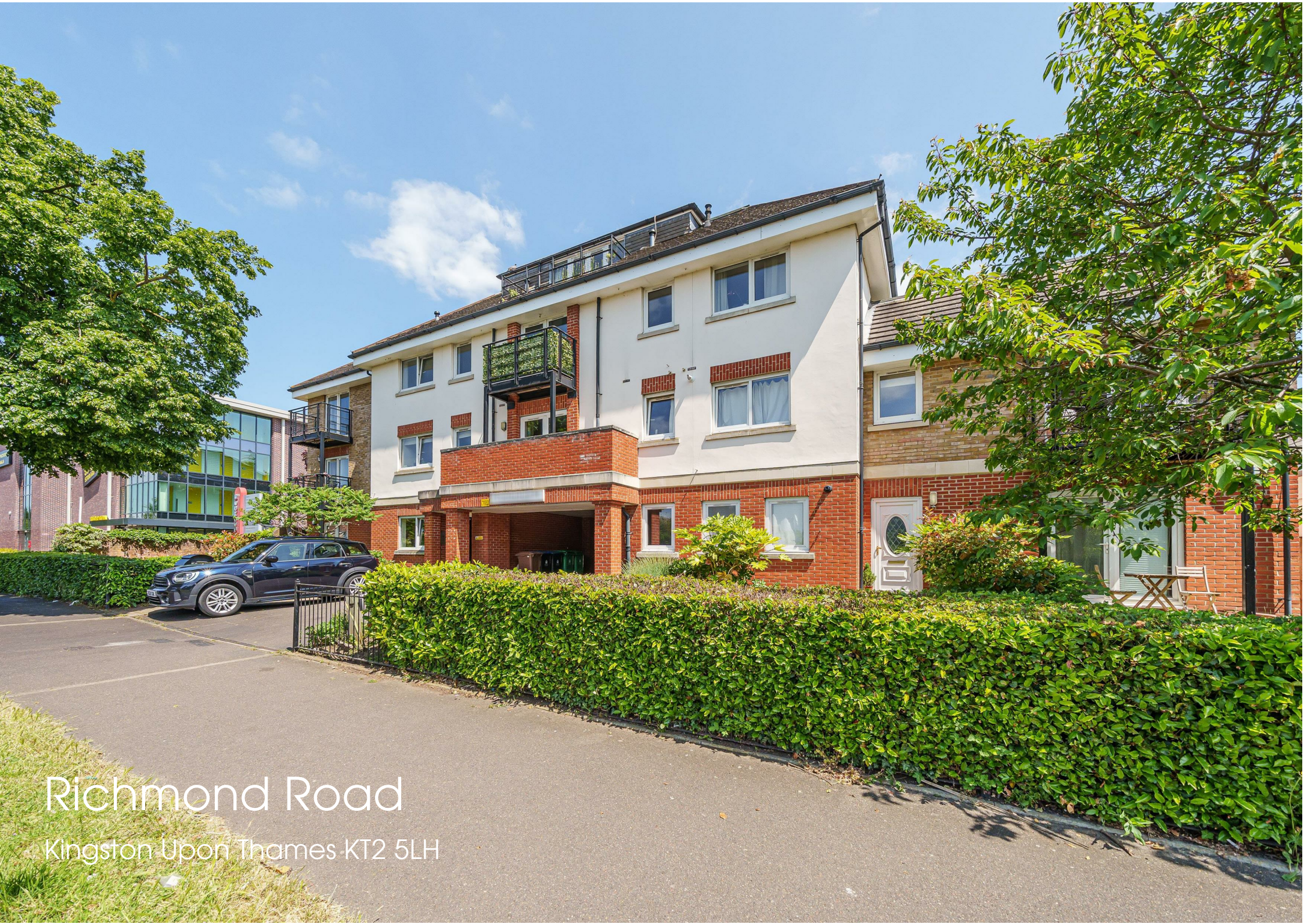
Richmond Road Kingston Upon Thames KT2 5LH